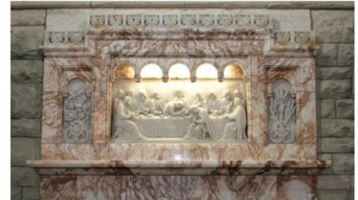
Dedicated in 1929 to celebrate the semi-jubilee of serving minister Rev D D Rees

Frigate gifted in 1804 and displayed in both churches until the present day