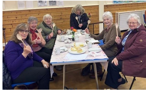
Team Dolly mixtures

Members of the Three Towns Guilds and friends gathered on Wednesday afternoon to enjoy a quiz competition and fellowship over 'Afternoon Tea' – with Kandy Bar cakes and sandwiches. The winning team each received a Guild china mug and the last team – well, you guessed – wooden spoons!