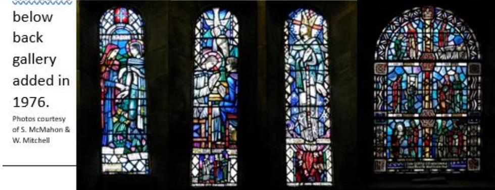
Smaller stained glass windows added in 1948