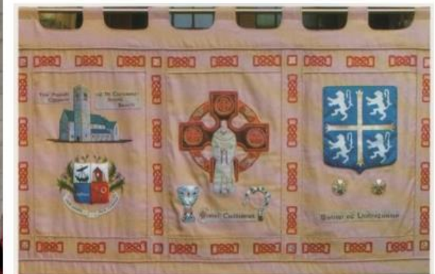
St. Cuthbert's Embroidery 1992